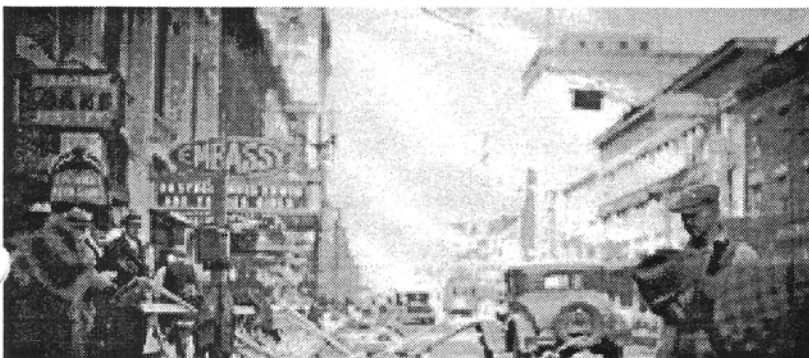
The street scene above shows the Embassy Theatre during a period of construction.

To learn more about the Embassy and its organ, go to the PSTOS website at www.pstos.org and click on N.W. Theatre Organ History. Then click on Washington, and scroll down to Embassy Theatre.